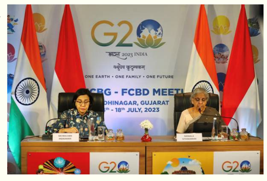
Ms. Sri Mulyani Indrawati, Minister of Finance, Indonesia, and Smt. Nirmala Sitharaman, Union Minister for Finance and Corporate Affairs announcing the launch of "India – Indonesia Economic and Financial Dialogue" at the 3<sup>rd</sup> FMCBG Meeting in Gandhinagar, Gujarat

Economic policymakers and financial regulators from both countries will come together for enhanced collaboration of bilateral as well as international economic and financial matters. Thrust areas for the EFD include macroeconomic challenges and global economic prospects, matters related to bilateral investments and strengthen cooperation through multilateral forums such as G20 and ASEAN.