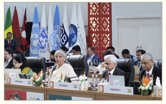
Hon'ble Finance Minister, Smt. Nirmala Sitharaman & RBI Governor, Shri Shaktikanta Das at FMCBG meeting

IFS participated in the 'Infrastructure' sessions of the third Finance Ministers and Central Bank Governors (FMCBG) meeting & third Finance and Central Bank Deputies (FCBD) meeting under the G20 Indian Presidency during 14th-18th July 2023 in Gandhinagar, Gujarat.