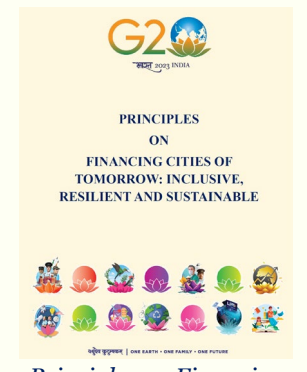
Principles on Financing Cities of Tomorrow: Inclusive, Resilient and Sustainable

benefits all segments of society and discussed ways to empower urban administrations to effectively tackle the challenges associated with infrastructure projects. IFS finalized the document on " Principles on Financing Cities of Tomorrow: Inclusive, Resilient and Sustainable " by incorporating suggestions and inputs received from member countries and IOs. The document has been endorsed by FMCBG during their 3rd meeting in Gandhinagar.